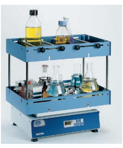
Double platform part no 3001011, with shaker Part No. 3000974

The "Rotabit" Part No. 3000974 and platform need to be ordered separately.