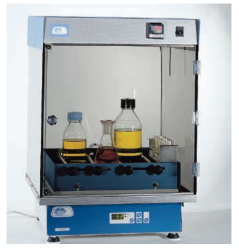
Orbital To & Fro shaker "Rotabit" complete with accessory. "Boxcult" incubation chamber.