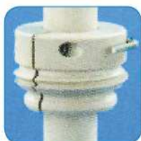
2" internal thread adapter