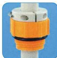
Trisure internal thread adapter