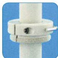
R2" internal thread adapter