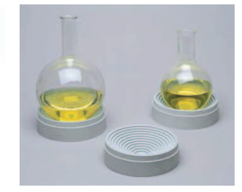
ROUND BOTTOM FLASK SUPPORT Made of moulded rubber (E.P.D.M.). Temperature resistance up to 100 °C. Specially designed with stepped surface to support different flask diameters. From 100 ml up to 10 litre capacity. Dimensions: 50 mm high x 160 mm Ø. Part No. 1000863