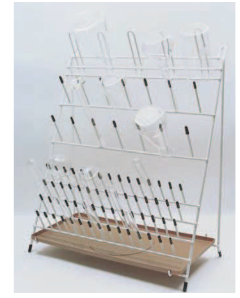
TABLE TOP OR WALL MOUNTABLE DRAIN RACK Made of PCV coated wire. 640 high x 500 mm wide. With 79 positions, complete with drip tray. Part No. 1000481