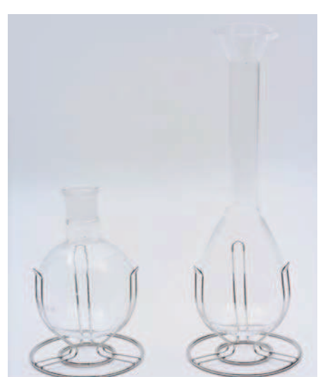
KJELDAHL FLASK SUPPORT Made of AISI 304 stainless steel with electrobright finish. Suitable for flasks up to 500 ml. Part No. 1000002