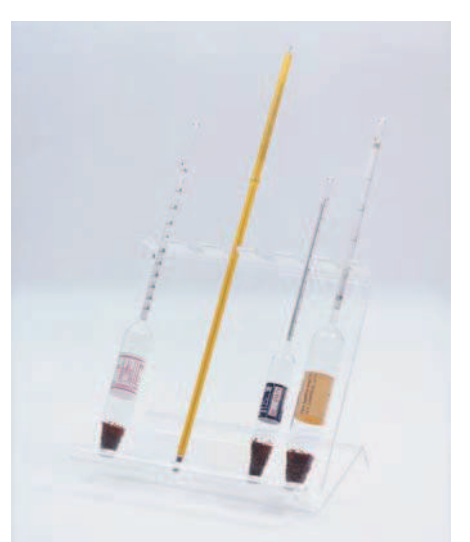
TILTED SUPPORT RACK "SOP-INC" Suitable for pipettes, hydrometers and thermometers rack, made of methacrylate. 6 positions. Part No. 1000015