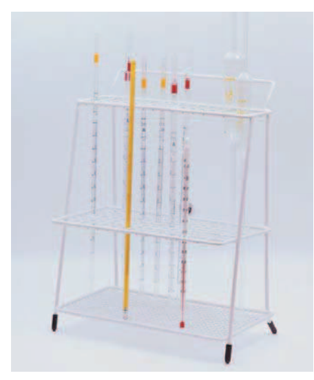
SUPPORT AND DRAIN RACK FOR PIPETES "SOP-PIP

Made AISI 304 stainless steel. Holds up to 112 pipettes of different sizes. Part No. 1001223